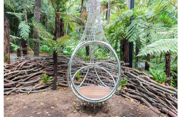
Plant Craft Cottage