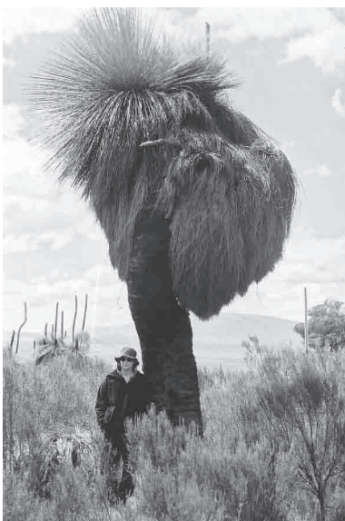
Figure 2. Xanthorrhoea glauca subsp. angustifolia on private land adjoining the Heathcote–Greytown National Park

Bellette (2009) has shown that the distribution of X. glauca inland is limited to areas with annual rainfall in excess of 450–500 mm. Locality records west of Bendigo are few and many appear to be associated with Tertiary alluvial (non-marine) deposits. Since the Oligocene, the sea has at times encroached into the Murray Basin causing possible disjunctions in plant populations and subsequent speciation. In Victoria, the maximum extent of inundation brought the coastline into what is Central Victoria today, most of the Otway Basin and coastal areas of the Gippsland Basin (Cochrane et al. 1995). The distribution of X. australis is associated with areas either