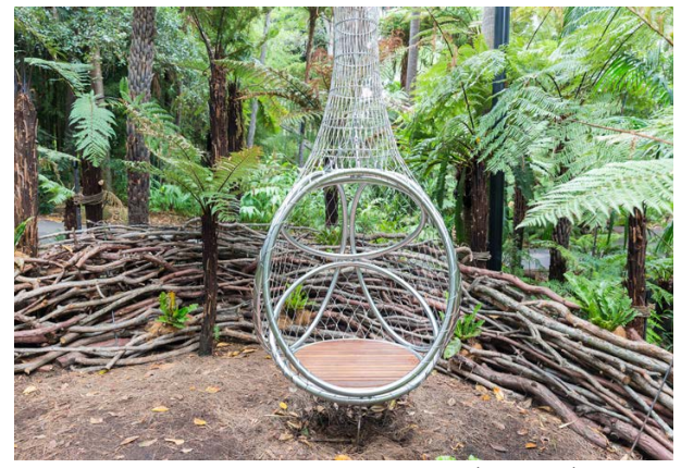
The Bird's Nest