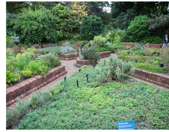
The Herb Garden