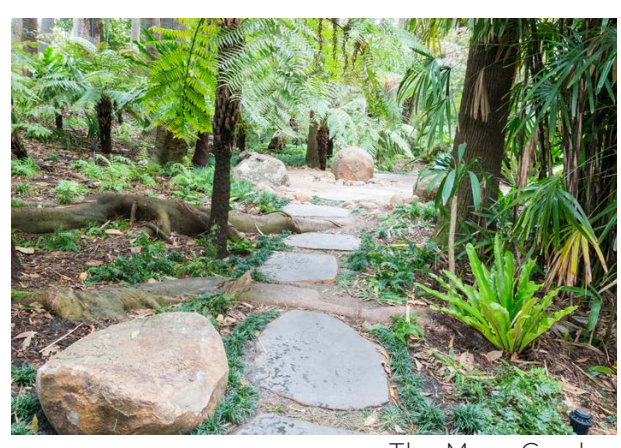
The Moss Garden