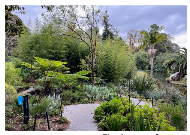
The Sensory Garden